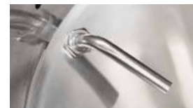
Tail piece installed